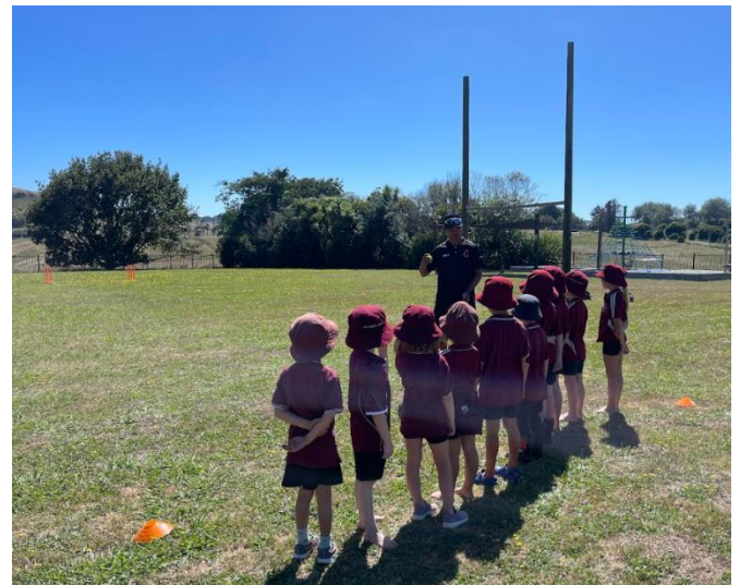
Koowhai students taking maths outside.